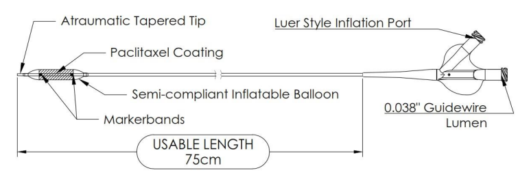
Figure 1-1. Optilume DCB Design

The Optilume® Urethral Drug Coated Balloon (Optilume DCB) Catheter is a 0.038" (0.97 mm) over-the-wire (OTW) guidewire compatible catheter with a dual lumen design and a tapered, atraumatic tip. The Optilume DCB is used to exert radial force to dilate narrow urethral segments (strictures). The distal end of the catheter has a semi-compliant inflatable balloon that is coated with a proprietary coating containing the active pharmaceutical paclitaxel. The drug coating covers the working length of the balloon body. The device has two radiopaque marker bands that indicate the working length of the balloon where the drug coating is applied. The drug coated balloon is covered with a protective sheath that is discarded prior to use.